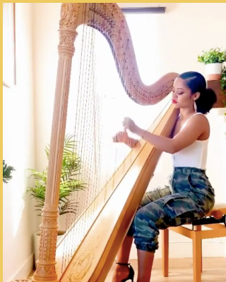
I AM a Harpist Classic instrumentalist