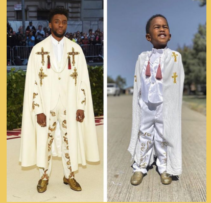
I AM Chadwick Boseman Actor / Black Panther