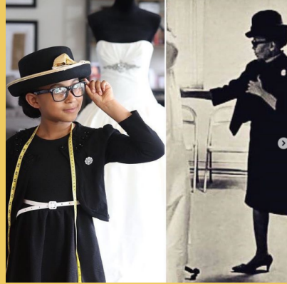
I AM Ann Lowe Fashion Designer