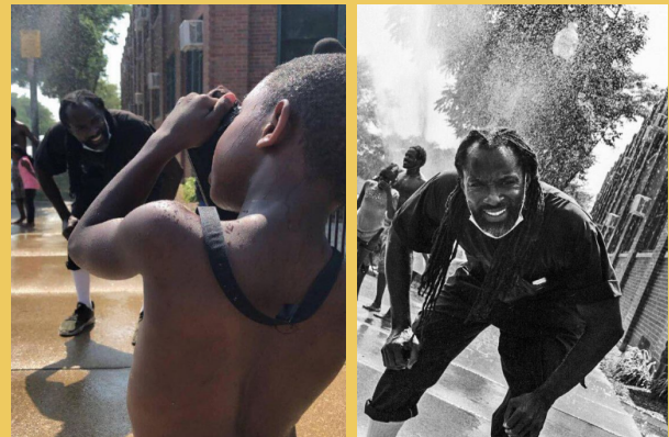
I AM a Photographer Capturing neighborhood joy