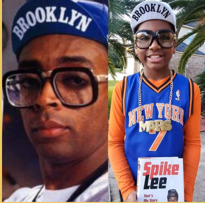
I AM Spike Lee Director / Producer